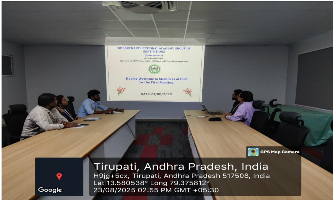
1 st BOS Meeting Geotagged Photo: Welcoming the BOS members by the HOD